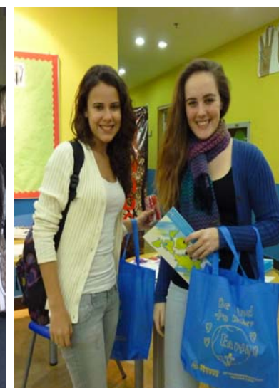
College Night 2011