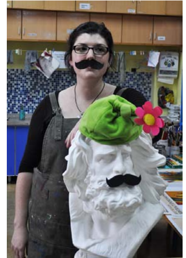
Don’t worry... at least one of these ‘staches is fake.