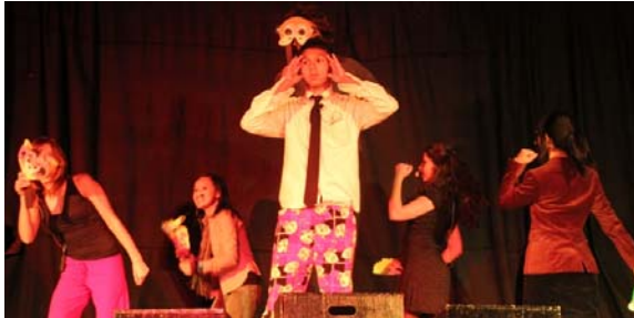
It's a jungle in here.