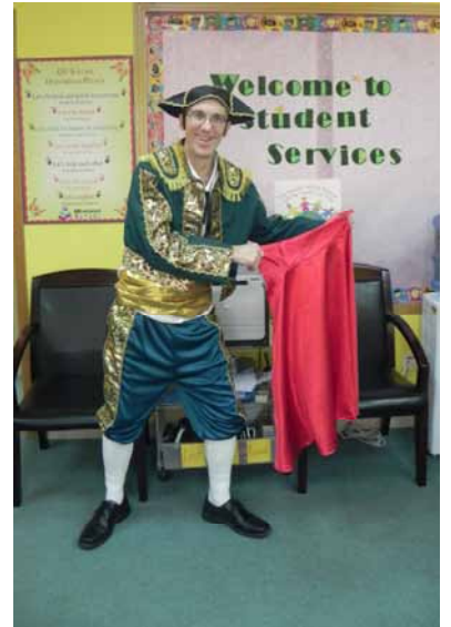
Dress Up Day