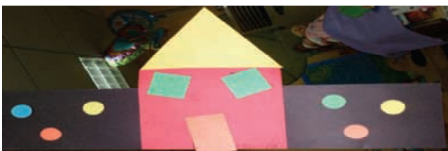
Houses Houses EVERY WHERE!!