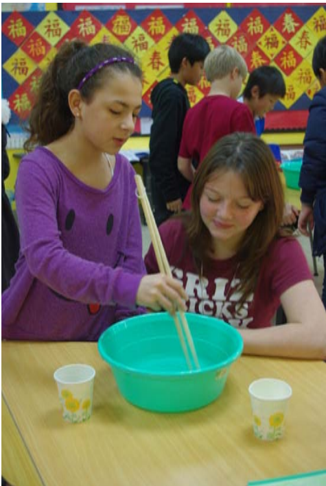
Picking up marbles with chopsticks