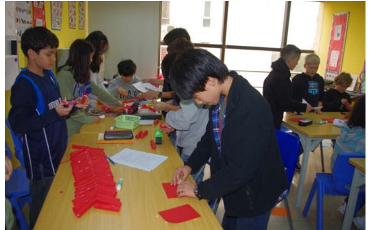
Paper firecrackers are more safe than the real ones!