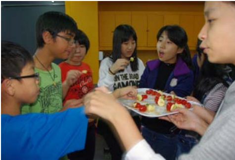
Learning to make some local food...