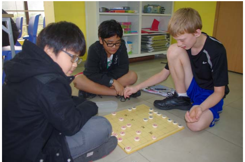
Can the parents defeat the kids at Chinese board games?