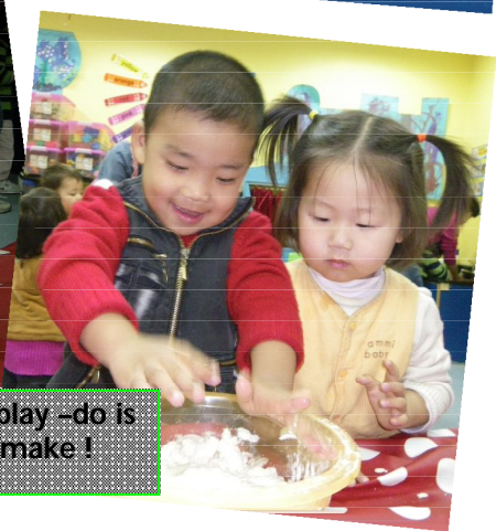
Uooh! Gooney play -do is so much fun to make!

Thank you for attending our Chinese New Year performance.! We were so proud of all of the 2 year olds. They did an excellent job on stage! A big THANK YOU goes to the paraprofessionals for putting the program together. We hope you had a wonderful holiday.