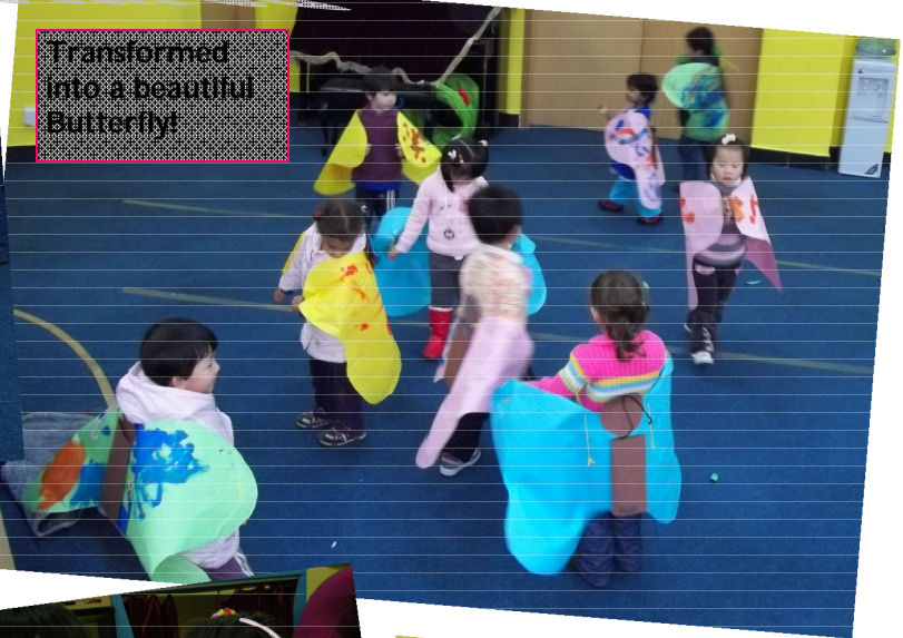
Transformed into a beautiful Butterfly!

Thank you to those parents who donated recyclable goods to the 2yo classes! We have already had a chance to use some donated material in a lion's mask collage. ROAR! If you have any other reusable material in need of a new home please send them to us. Thanks again!