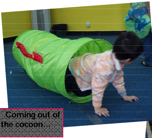
Coming out of the cocoon...