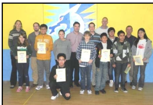
11-13 SOQ2 and the teachers who nominated them