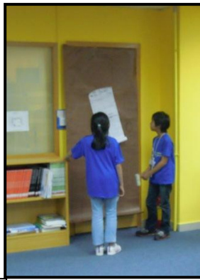
Martin puts up 95 Theses