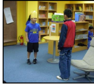
Henry VIII makes England Protestant