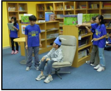
The Pope orders Tetzel to sell indulgences