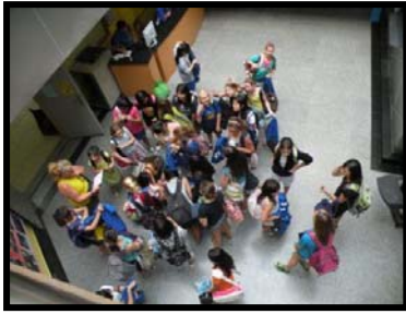
Girls get uniforms

Boys' and girls' soccer teams visited Guangzhou this week. The long bus ride may seem like a tedious odyssey to coaches, but the students make use of the time to get to know each other and get pumped up. The boys continued to