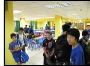
Boys look relaxed

The girls played in squads so more could get into the game and fell short 3-2. Every match is important as it provides opportunities to learn for players and coaches.