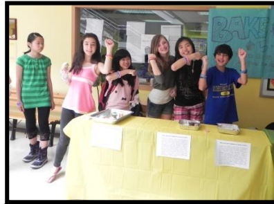
French class bake sale with arm bands